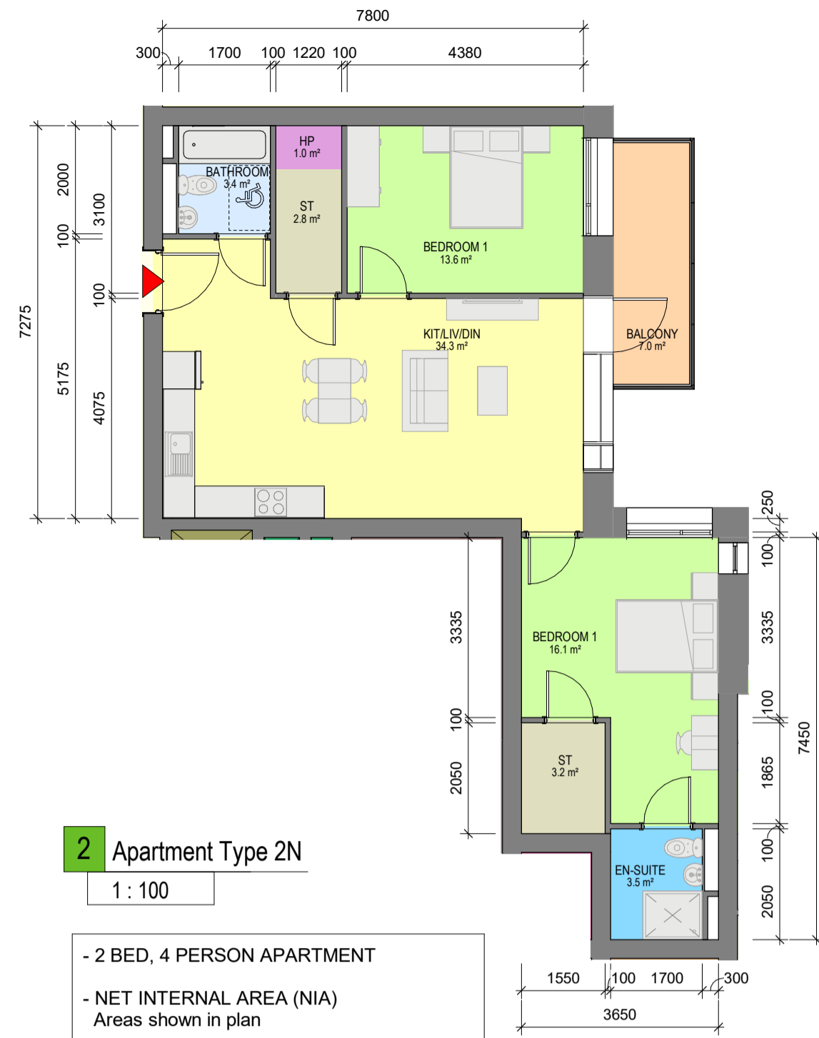
2 Apartment Type 2N 1 : 100