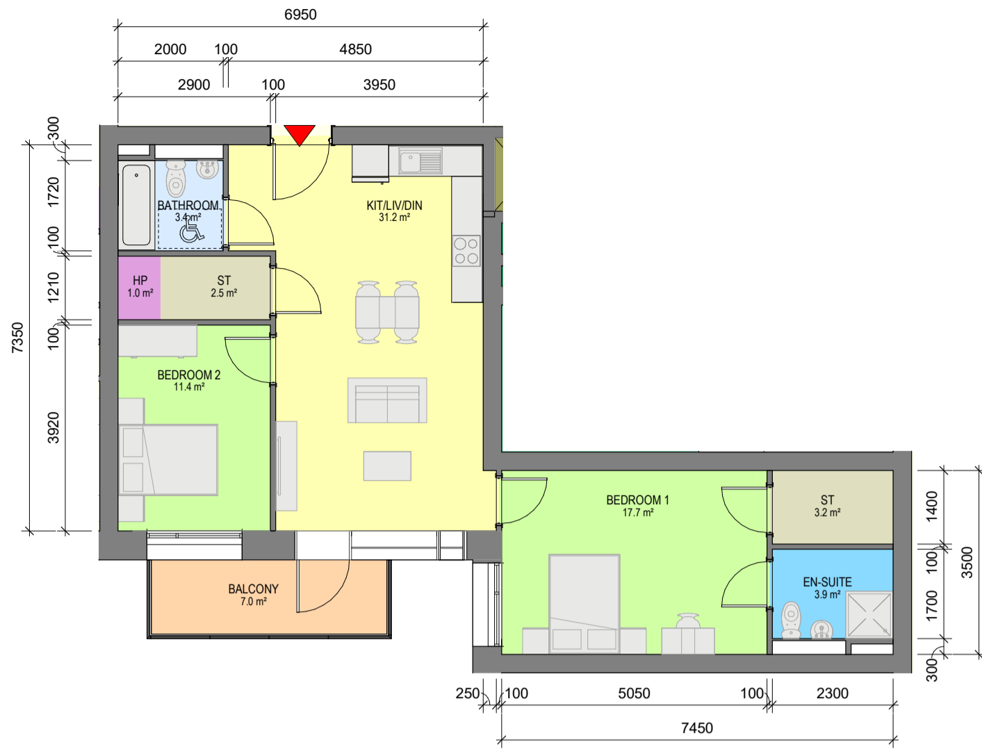
1 Apartment Type 2M 1 : 100