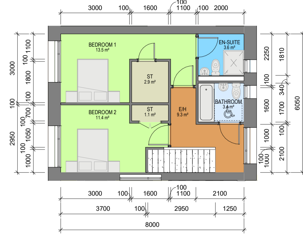
2 Apartment Type 2A - Duplex - Part 2