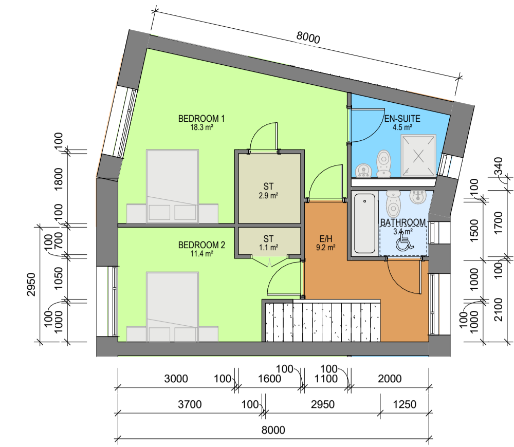
4 Apartment Type 2B - Duplex - Part 2