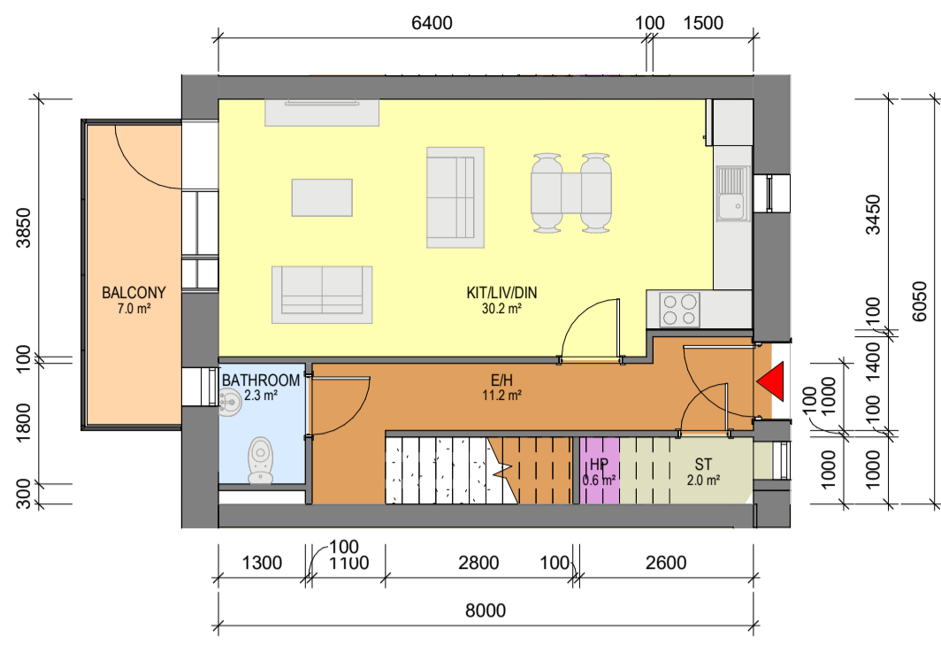
1 Apartment Type 2A - Duplex - Part 1