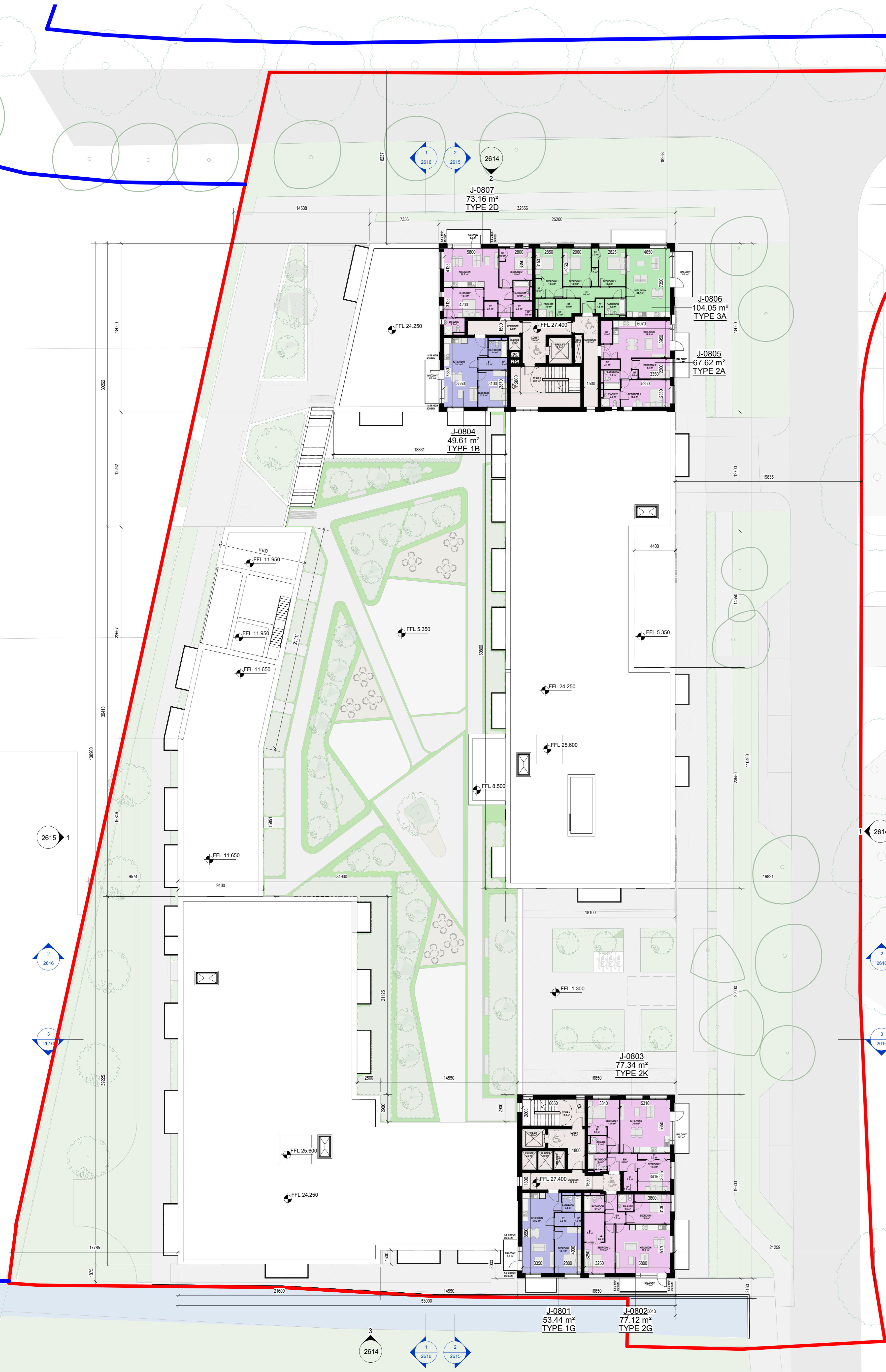
1 PLAN - BLOCK J - LEVEL 08 1 : 200

Please consider the environment before printing this sheet