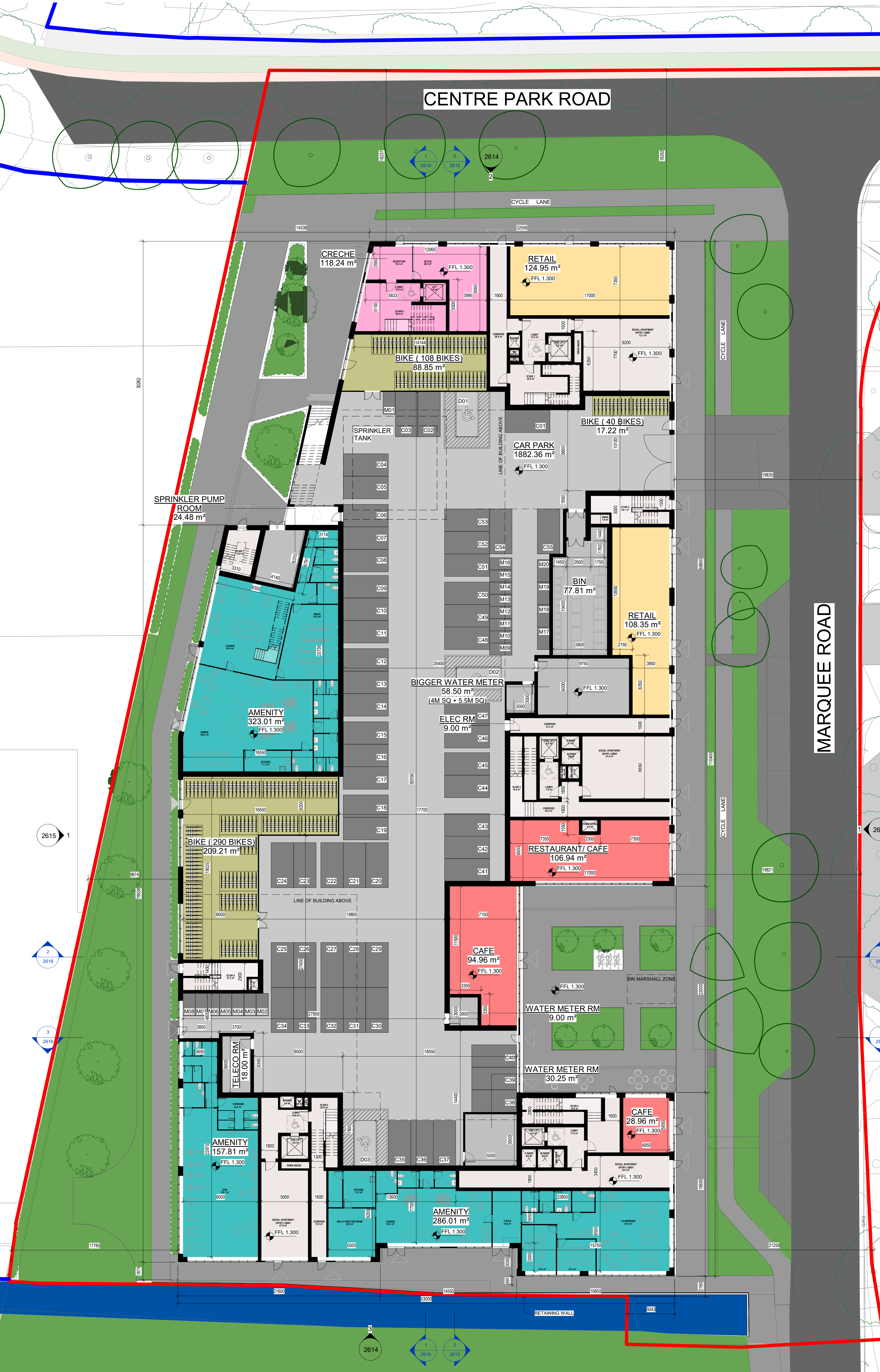
1 PLAN - BLOCK J - LEVEL 00 1 : 200

Please consider the environment before printing this sheet